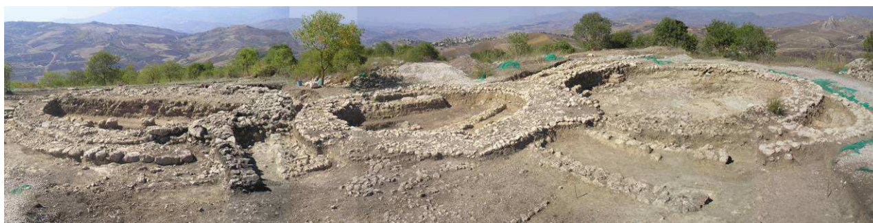
Figure 1. The Acropolis during the excavation.