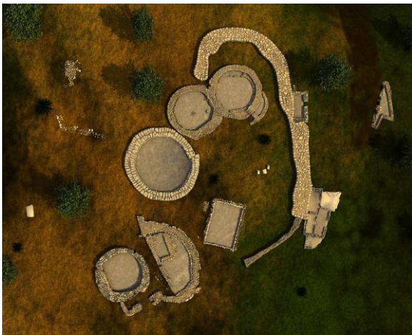
Figure 3. Virtual reconstruction of the Acropolis.

as a result of the slip of land and weather agency, it probably included a monumental entrance on the north side in front of building A. Along its east side, the temenos was modified by the adjunction of a small rectangular ambient, later in chronology, Room III, partially built and excavated inside of it. Contemporary to Room III are two House belonging to a residential quarter, dated back to the end of the 5th century BC, namely the Temenos House, adjacent to the temenos wall, and the East House, in a smooth plain in eastern slope. The two buildings reflect the construction techniques of Greek Sicily and have such characteristics that they can be intended as part of a workshop district still partially unrevealed. The construction technique shows large rectangular blocks with two courses and a flat roof with tiles. Within the rooms, rolled on the floor by the collapse of the ceiling, was found sets of pottery and objects, such as between transport amphorae, table wares, cooking pots and storing jars, and especially some large mortars for grinding olives.