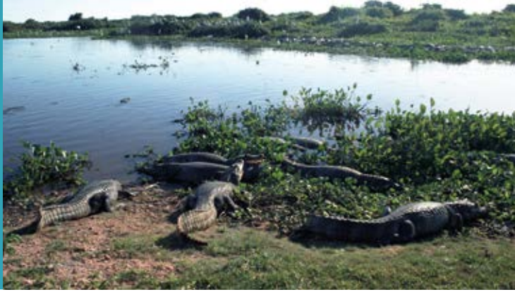
The Pantanal, Brazil.