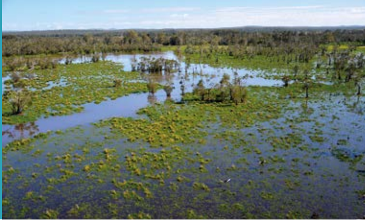
Everlasting Swamp, Clarence River floodplain, Australia.