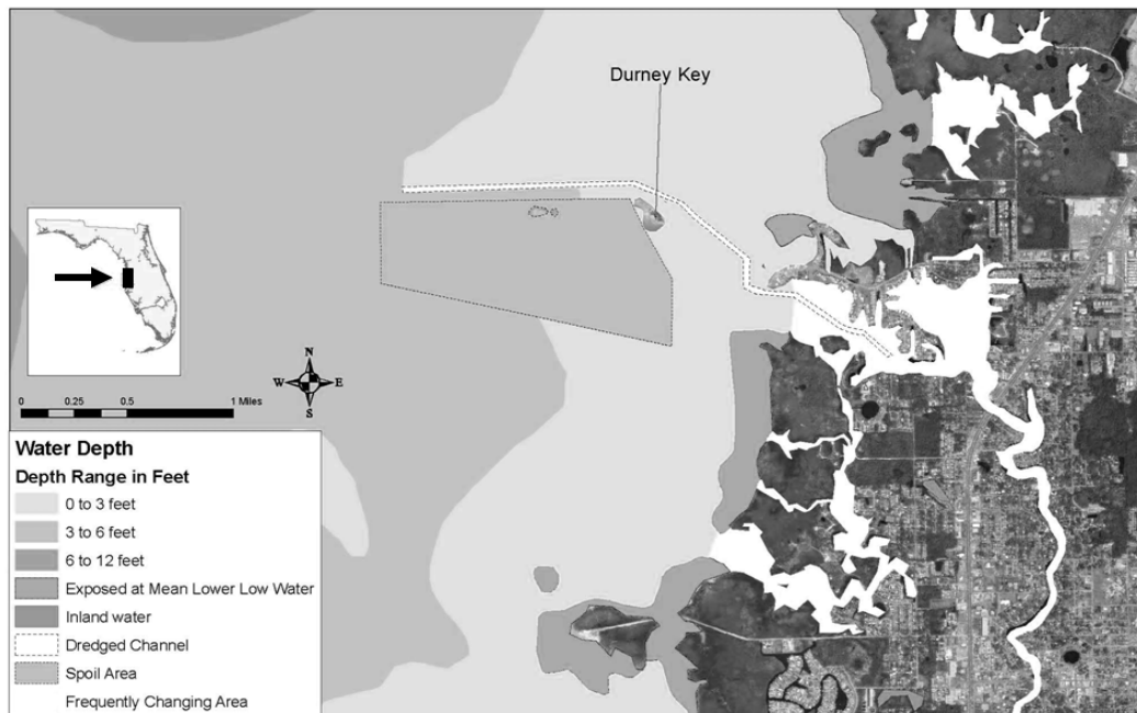
Fig. 1 Coastal Pasco County, Florida, with Durney Key indicated; inset shows location in Florida, USA (adapted from Florida Fish and Wildlife Research Institute).

taxa can vary dramatically between samples and over time, as demonstrated by Buzas et al. [9]. While several authors have argued against analyses based on total assemblages [4-7], others have argued that total assemblages in sediment samples can be used to interpret conditions integrated over time [10].