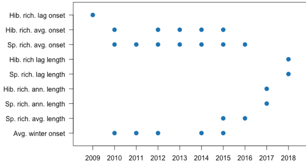
Figure 1: Best-supported models at the end of each year from 2009-2018. All models with \Delta AIC < 2 for any year (from 2009-2018) are included and a mark indicates \Delta AIC < 2 for the given year.