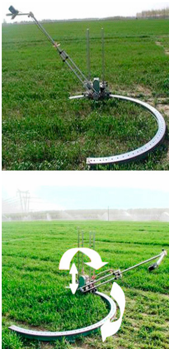
Figure 1. Rotating bracket for observing BRDF canopy reflectance.

The same spectral instrument used for measuring in situ canopy reflectance spectra was used to take canopy bi-directional reflectance function (BRDF) reflectance spectra under cloud-free conditions between 10:00 a.m. and 14:00 p.m. (Beijing local time) at a principal plane and a cross-principal plane on 28 April (Booting, Zadoks 41), 9 May (Flowering, Zadoks 65), and 16 May (Milk development, Zadoks 73), in 2004. The similar canopy BRDF reflectance spectra were taken on 28 April, 11 May, and 16 May, in 2007. In accordance with the measuring method introduced by Huang et al. [26], a rotating bracket was used to fix the spectral instrument (Figure 1). View zenith angles were from -60^\circ to 60^\circ with 10^\circ intervals. The negative angles represented face-to-the-sun, while the positive angles represented back-to-the-sun. Twenty spectra were taken at each view angle.